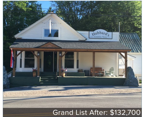
Grand List After: $132,700