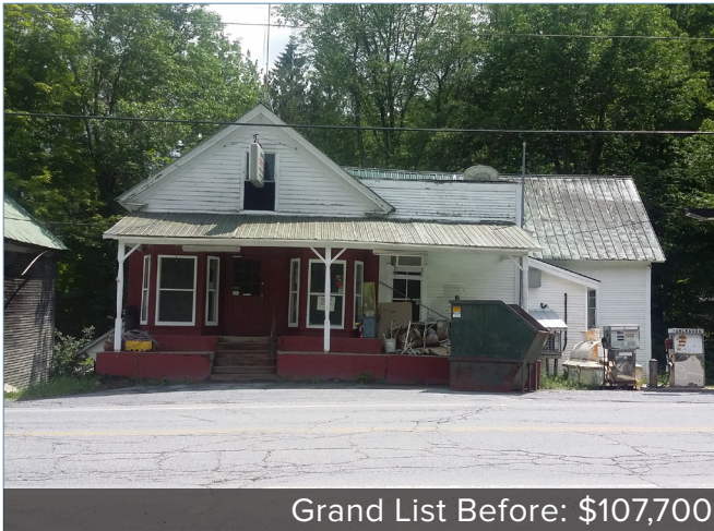
Grand List Before: $107,700

Hancock's General Store operated for over 100 years before closing in 2013. A major community hub in this small village, the loss of this business was devastating to residents. That's when new owners, locals from Hancock, stepped in to buy the building and revive this important community resource. The project required major investments to upgrade the building to meet code requirements and also included façade improvements. The store re-opened in 2016.