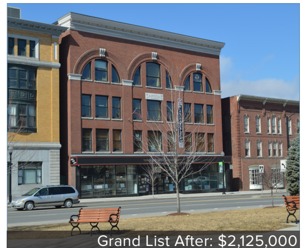
Grand List After: $2,125,000