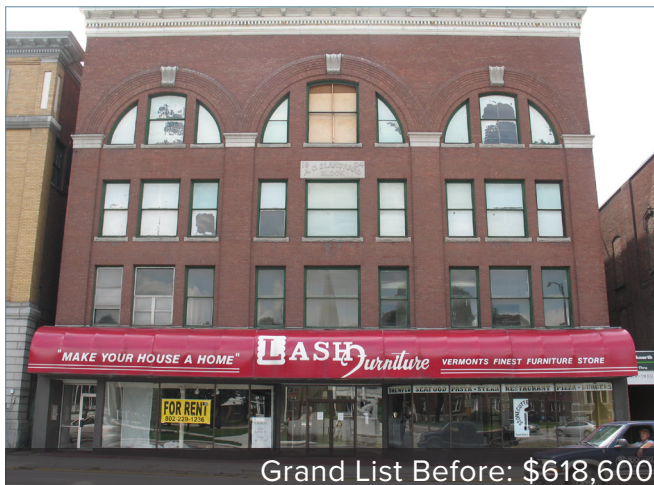
Grand List Before: $618,600

Standing on a prominent downtown lot across from Barre's city hall park, the Blanchard Block (1904) was designed by prominent Vermont architect Lambert Packard. Largely vacant in 2012, tax credits provided incentives for new owners to install an elevator, add a sprinkler system in the building, and complete major interior and exterior rehabilitation work. Now the five-story building provides 48,000 square feet of safe, accessible and modern commercial and office space. It is also one of several recent tax credit projects that helped transform downtown Barre.